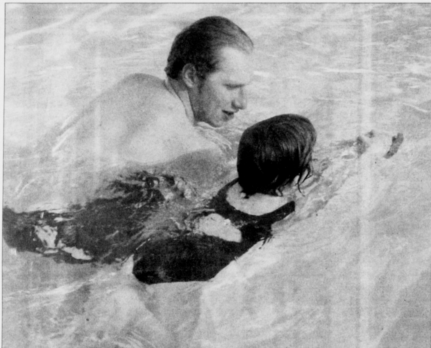
A Portland Parks and Recreation swim instructor works with a beginner swimmer.