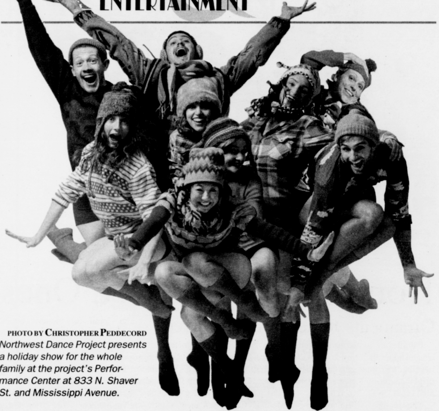
Northwest Dance Project presents a holiday show for the whole family at the project's Performance Center at 833 N. Shaver St. and Mississippi Avenue.