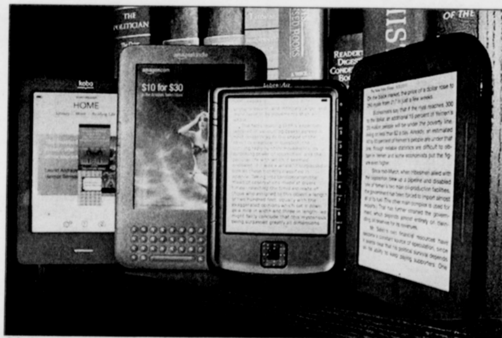
Multnomah County Library offers classes to educate holiday shoppers about how to select the e-reader that will best meet their needs.

In this class, librarians guide you one-on-one through the process of using the Library2Go service to download books and audiobooks for free with your Multnomah County Library card. Please bring your device and any equipment you need to download