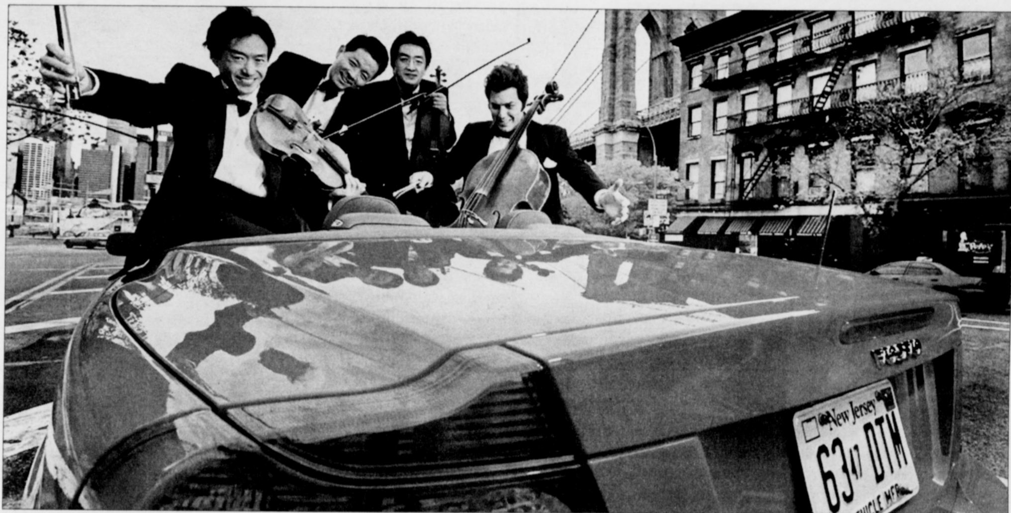
The Shanghai Quartet blends the delicacy of Eastern music with the emotional breadth of Western music. The group will perform in Portland Monday, Dec. 3 and Tuesday, Dec. 4 in Lincoln Hall at Portland State University.

For tickets, call 503-224-9842 or visit boxofficetickets.com .