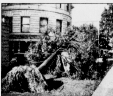
exhibit that runs through Jan. 6 at the Oregon History Center, downtown.

Tsunami Artifacts on Display -- Two pieces of the massive 201 ton dock that was washed away from a city on Japan's northeast coast by the devastating March 2011 tsunami and that landed on Oregon's Agate Beach this past June have now arrived at the Oregon Historical Society in Portland. The two metal boat tie offs are on display in the "Treasures of the Vault" exhibit through Dec. 30.