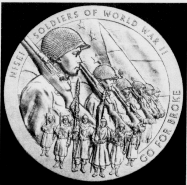
The Congressional Gold Medal awarded to Japanese-American World War II veterans by Congress in 2011.

Despite the fact that many of their parents and family members were held in internment camps during World War II, over 19,000 Japanese American soldiers served in U.S.