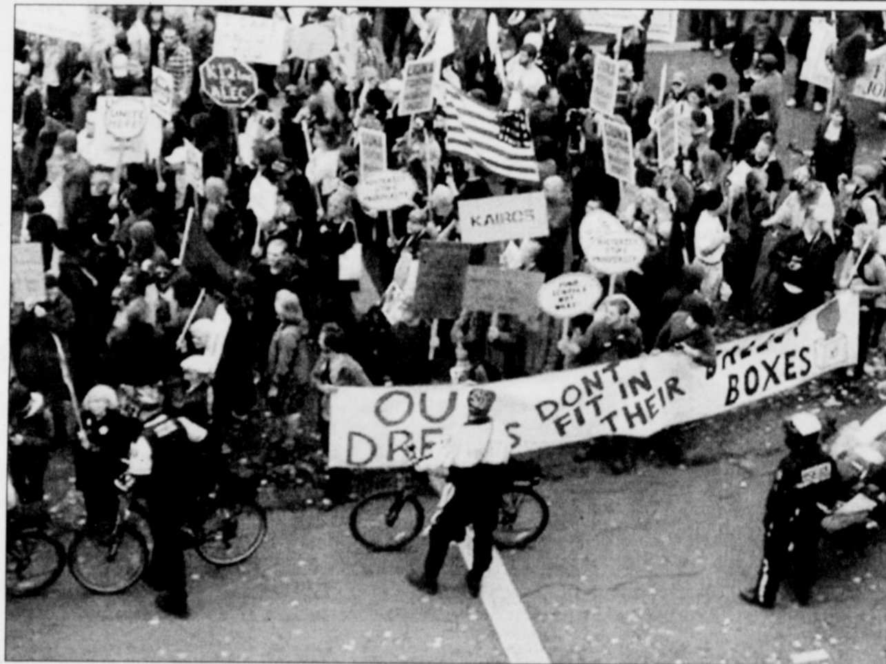
Demonstrators near Holladay Park in northeast Portland Saturday during a 'Solidarity against Austerity' march.

Officers deployed pepper-spray to front line demonstrators and seized their "ramming devices and shields," police said. Demonstrators then backed up and walked east-