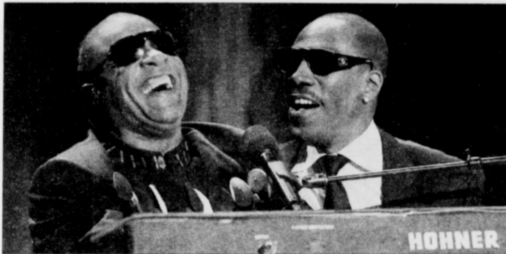
Stevie Wonder (left) performs a duet with Eddie Murphy for a Spike TV tribute to Murphy set to air Nov. 14.

Sandler was still in high school when he first saw "Delirious," which he described as "one of the most legendary standup specials of all time."