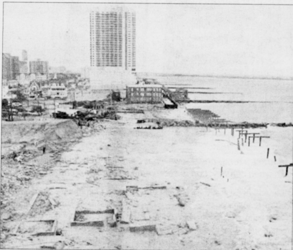
Foundations and pilings are all that remain of brick buildings and a boardwalk in Atlantic City, N.J., after they were destroyed when a powerful storm that started out as Hurricane Sandy made landfall on the East Coast on Monday night.