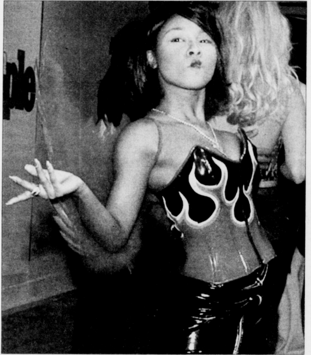
Actress and rap star Natina Reed was killed in a traffic accident Friday in Atlanta.

Reed was a protege of TLC's Lisa "Left Eye" Lopes -- who herself passed away in a 2002 car accident.