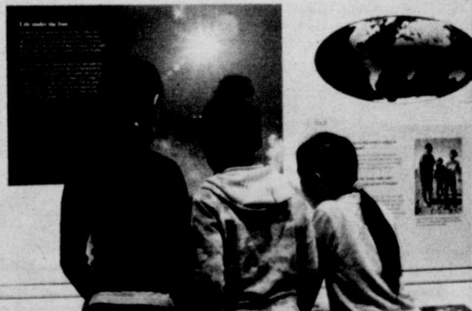
Why do people come in so many colors? At OMSI's new exhibit on RACE, visitors learn about scientific theories that may explain the variation in human skin color found around the globe.

Sunlight and vitamins determine our skin color—not race.