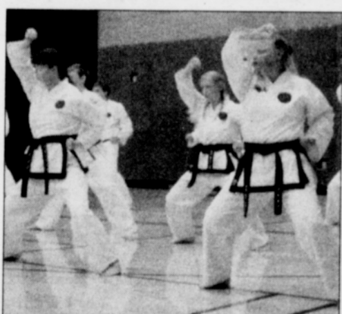
A martial arts class at Portland Parks and Recreation's South-west Community Center.