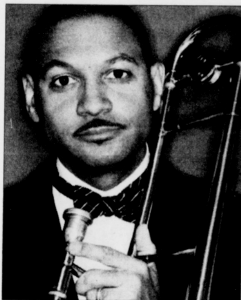
Trombonist Delfeayo Marsalis

PDX Jazz, the presenting organization of the Portland Jazz Festival in partnership with Jimmy Mak's,