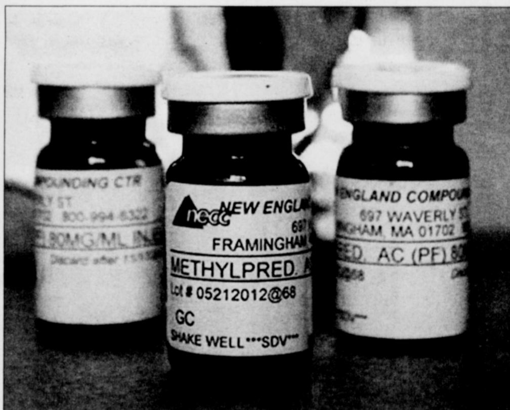
Vials of the steroid distributed by New England Compounding Center implicated in a meningitis outbreak.

Flowers' Chiropractic Office 2124 N.E. Hancock Street, Portland Oregon 97212 Phone: (503) 287-5504