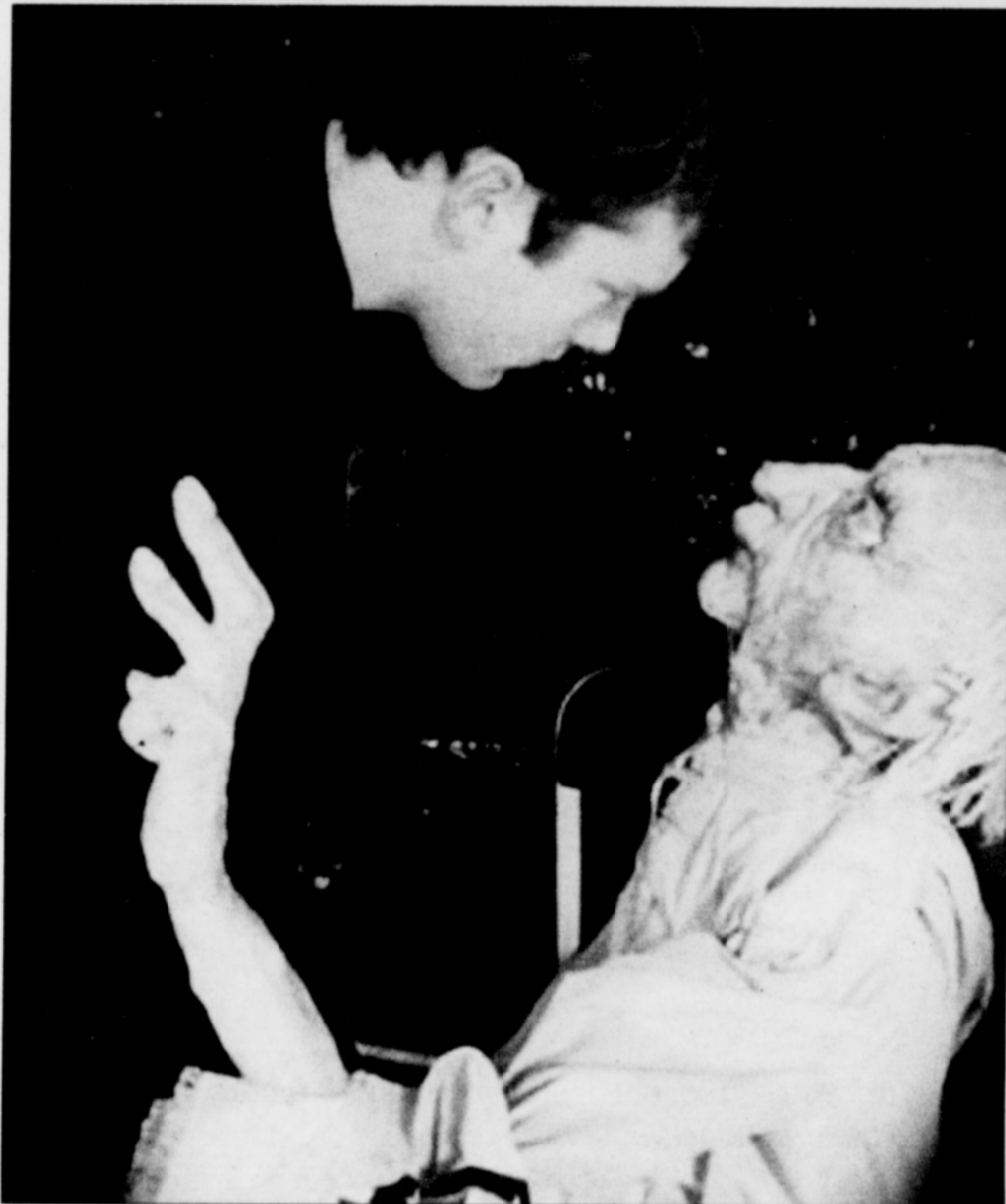
Tears of Joy Theater adapts a short horror story from Edgar Allan Poe.

Admission is $14 for students and $17 for adults. A special performance will take place Thursday, Oct. 26 at 8 p.m. with $5 tickets for all PSU students. For tickets, call 503-248-0557 or visit tojt.org .