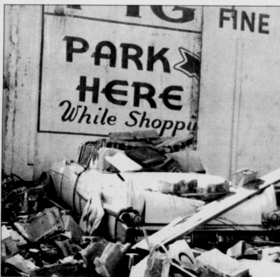
A car is left in ruins after a pile of bricks and other building materials collapsed from the top of nearby structure during the hurricane force winds of the Columbus Day Storm, 50 years ago this month.

The 50th anniversary of the most disastrous weather event to hit Oregon, the Columbus Day Storm is being commemorated with "The Mightiest Wind," a new exhibit at the Oregon History Center, downtown.