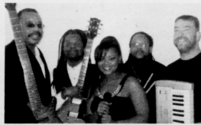
Live entertainment by The Light Band and Ocean503

The Portland Observer Foundation is giving six scholarships to students and acknowledging community service leaders.