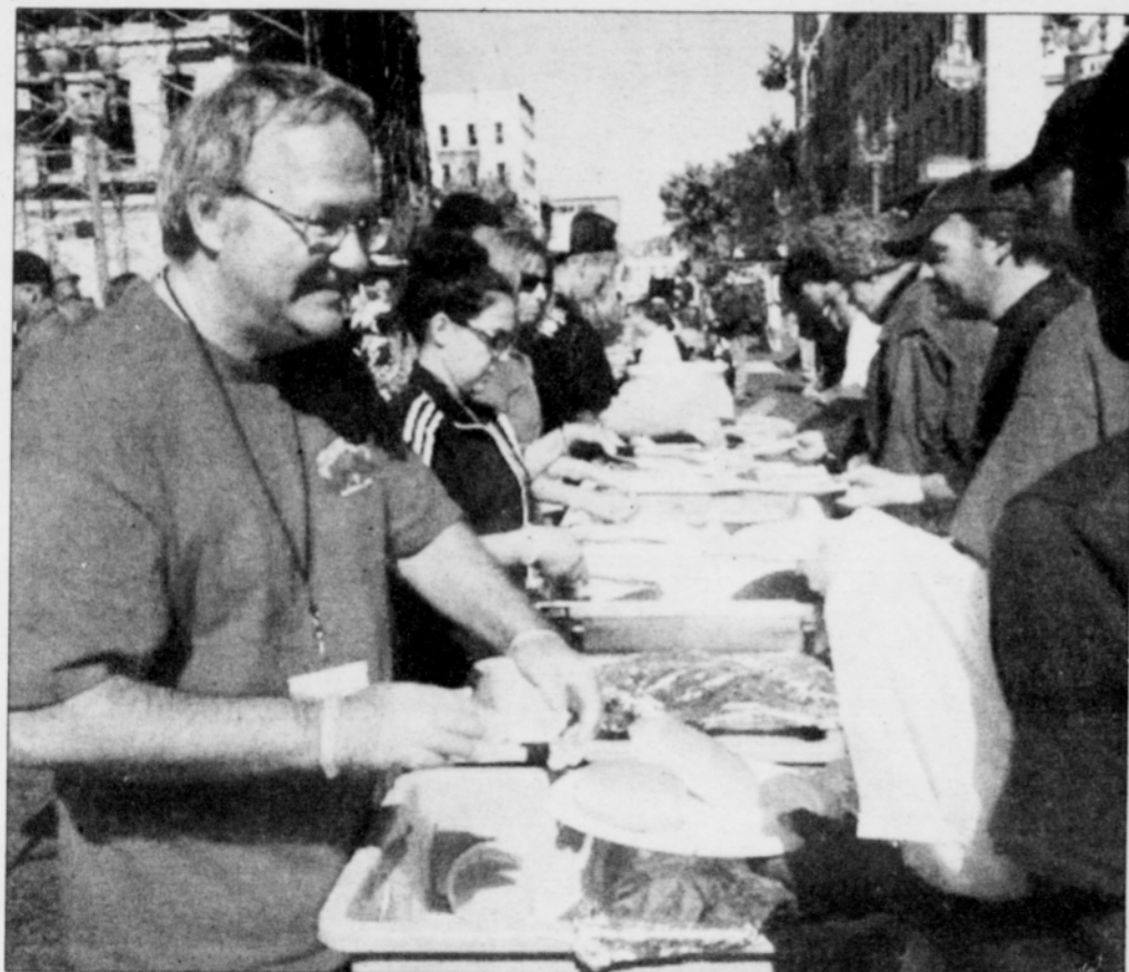
Downtown crowds enjoy food, and music at Operation Overcoat, Union Gospel Mission's annual street fair and clothing give away for the homeless and needy.