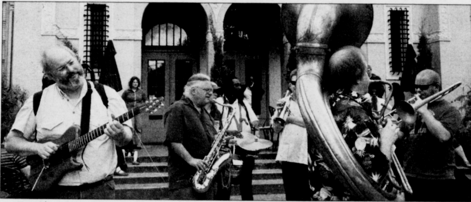
The McMenamins Oompah Band will perform in St. Johns Saturday for the north Portland neighborhood's Oktoberfest.