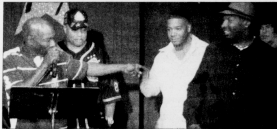
Portland's U-Krew built up a strong following with their mixture of hip-hop and R&B in the 1980s. The band will be reunited during a performances on Saturday at the Aladdin Theater during their induction into the Oregon Music Hall of Fame.