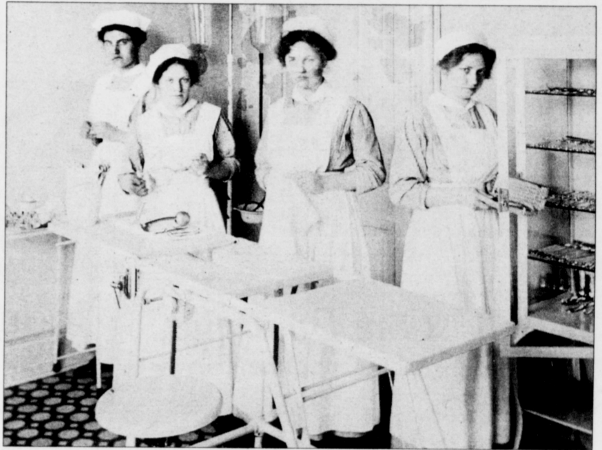
At Legacy Emanuel's anniversary celebration Saturday, the north Portland hospital will share historic stories from 100 years of service like this photo of an original Emanuel Hospital operating room taken between 1912-1915.

Visitors may also register for a bone marrow donor registry drive at marrow.org .