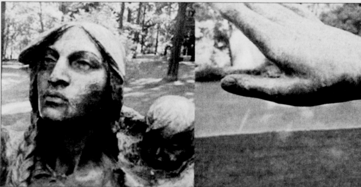
Oxidation of Sacajawea's bronze surface is beginning to take hold on the hand and face. The Washington Park monument will be restored with the support of two local arts organizations.

The total cost of the maintenance work is expected to be $12,337, and the restorations will be completed by April.