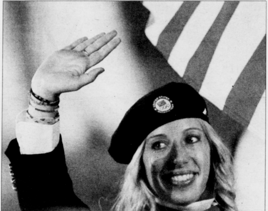
Mariel Zagunis carries the stars and stripes as the official Flag Bearer for 2012 Games in London. The Beaverton resident is Grand Marshal of Saturday's Beaverton Celebration Parade.

Bring Your Signs and Banners! Volunteers are Welcome. For more information, call 503 993-5280 or email us at svlts@msn.com . Sponsored by SVLTS II, HCC Mission & Outreach. If the community leads, the leaders will follow.