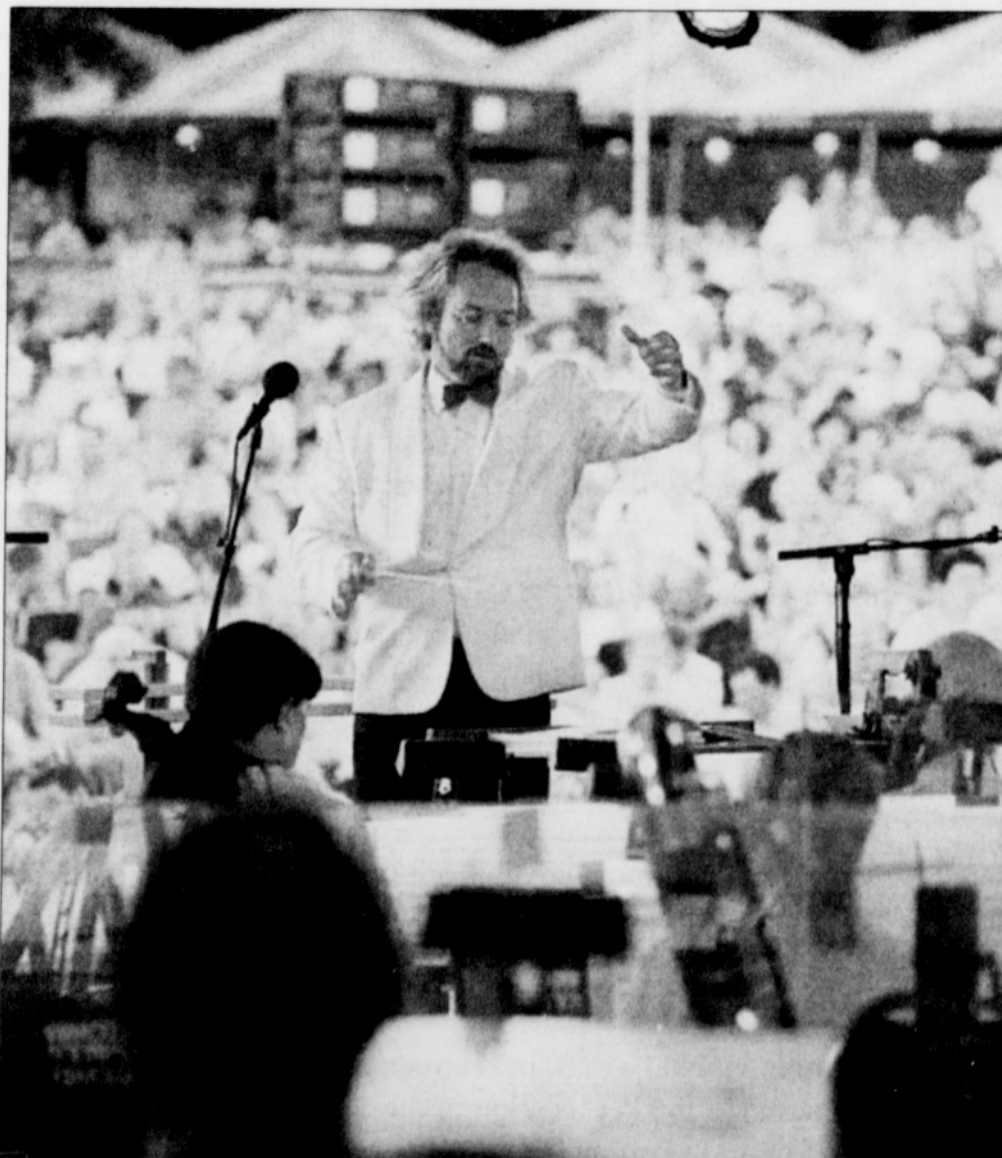
Classical music takes center stage for a free concert by the Oregon Symphony on Thursday, Aug. 30 at Tom McCall Waterfront Park, downtown.

The festivities conclude with the traditional grand finale — Tchaikovsky's 1812 Overture complete with military cannons from the Oregon Army National Guard 218th Field Artillery. Immediately following the 1812 Overture we'll light up the skies with an elaborate fireworks