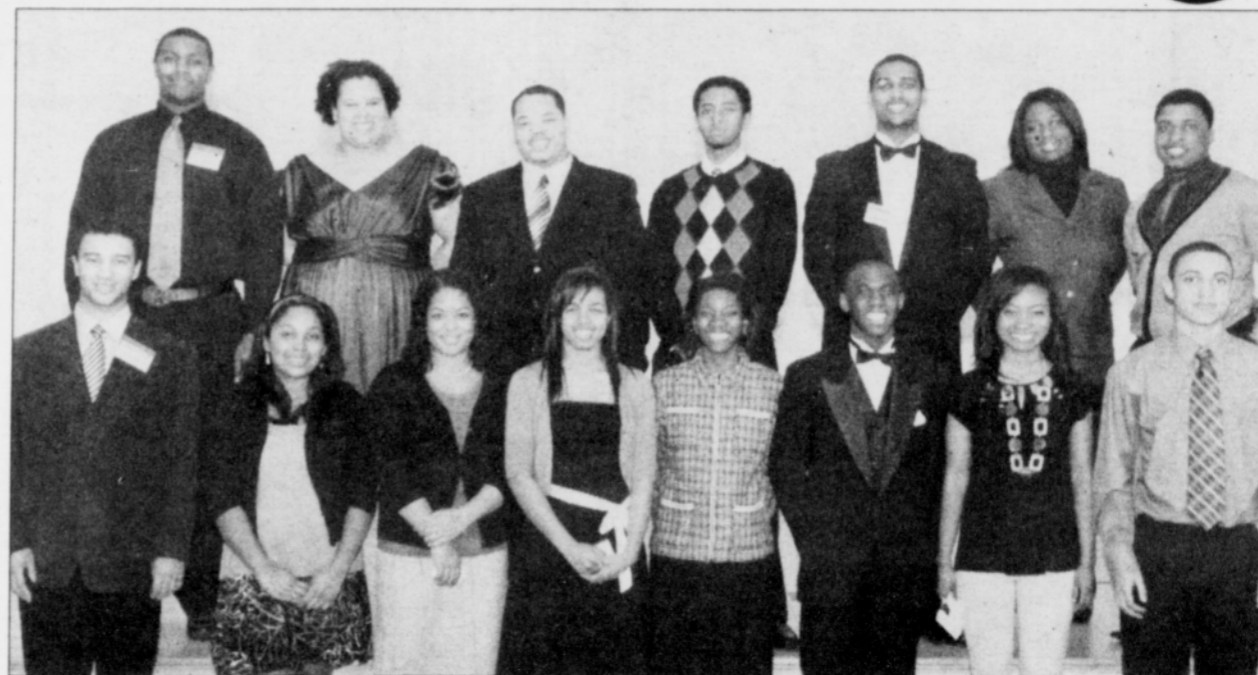
A group of high school students form a Black United Fund's College Access mentoring program from a prior year. Applications are being taken for the upcoming school year.

The Black United Fund also awards multiple scholarships yearly thanks to partnerships with the University of Portland, George Fox University, Lewis and Clark College, Reed College, Concordia Univer-