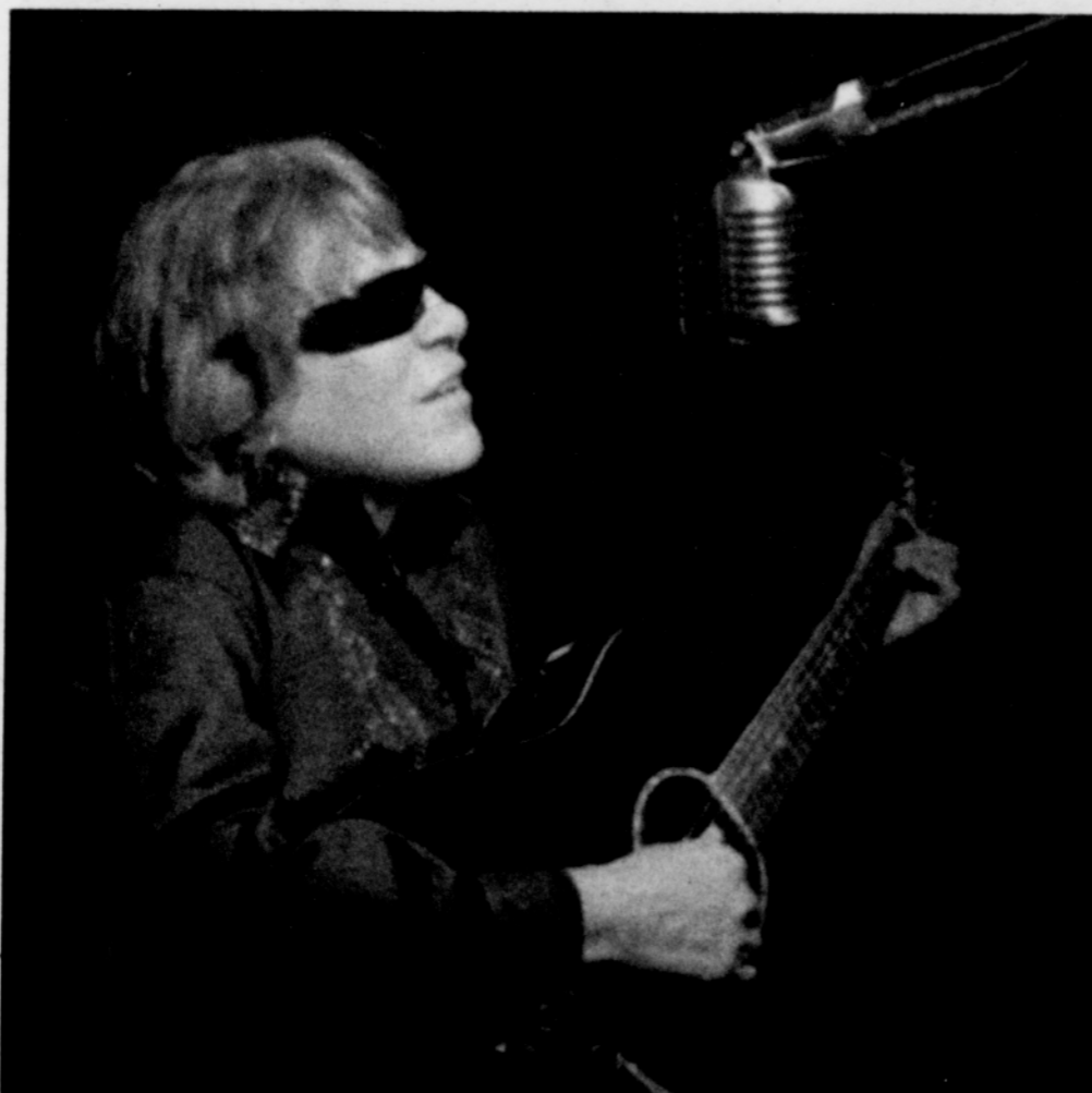
Eight-time Grammy winning legend Jose Feliciano fronts a line-up of jazz, blues and Latin musicians who will perform at the Vancouver Wine and Jazz Festival, Thursday, Aug. 23 through Sunday, Aug. 26.

The Festival features over 200 wines from around the world. At-