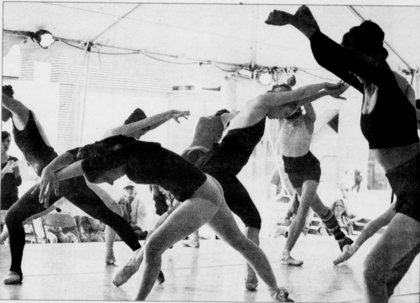
Oregon Ballet Theater will be returning once more to Director Park, downtown, Aug. 20-24, for a week of free public rehearsals, classes, dance films and events called OBT Exposed.

The week will also feature free daily creative movement classes for kids, showings of dance films and a lecture and demonstration with Lidberg.