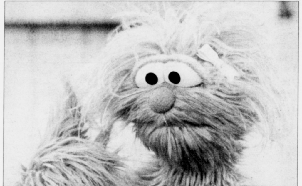
The character Rosita from Sesame Street gestures during a taping of the show in New York.

"We hope many people show up. We know the Latino community is full of talented people," said Rocio