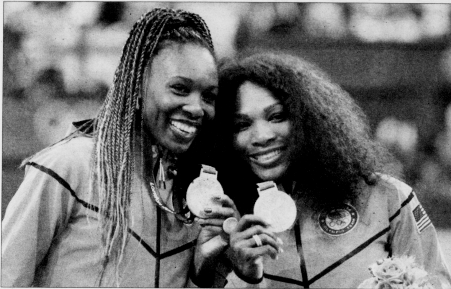
Gold medalists Serena Williams and Venus Williams celebrate during Sunday's medal ceremony for the Women's Doubles Tennis at the London 2012 Olympic Games.