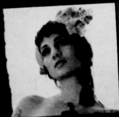
Luz of Y La Bamba

August 8 • August 22 5-9pm (Gates close at 8pm)