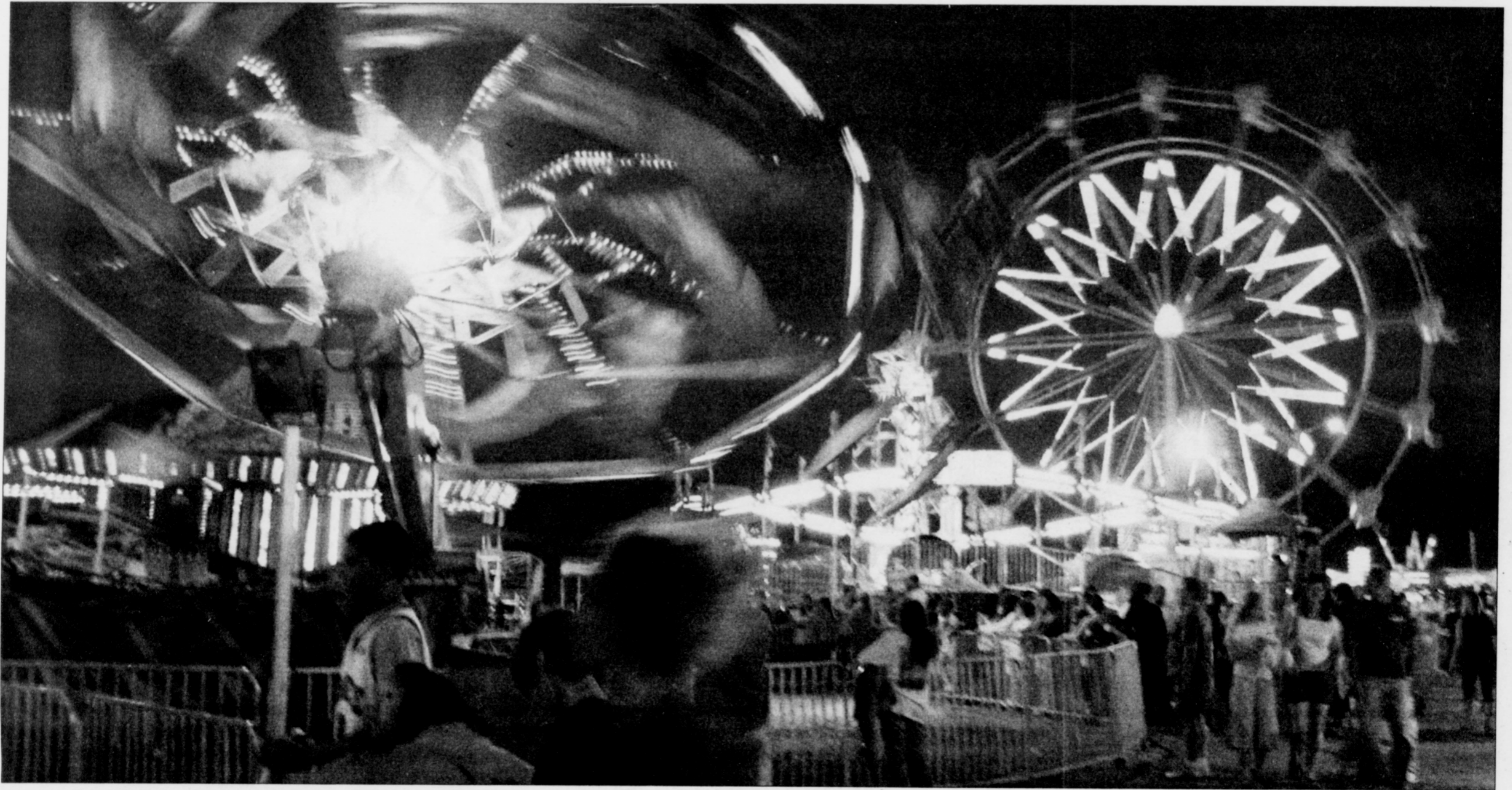
Adventure, fun and thrills for all ages draw area residents to the Clark County Fair in Ridgefield, opening Friday, Aug. 3 and continuing through Sunday, Aug. 12.