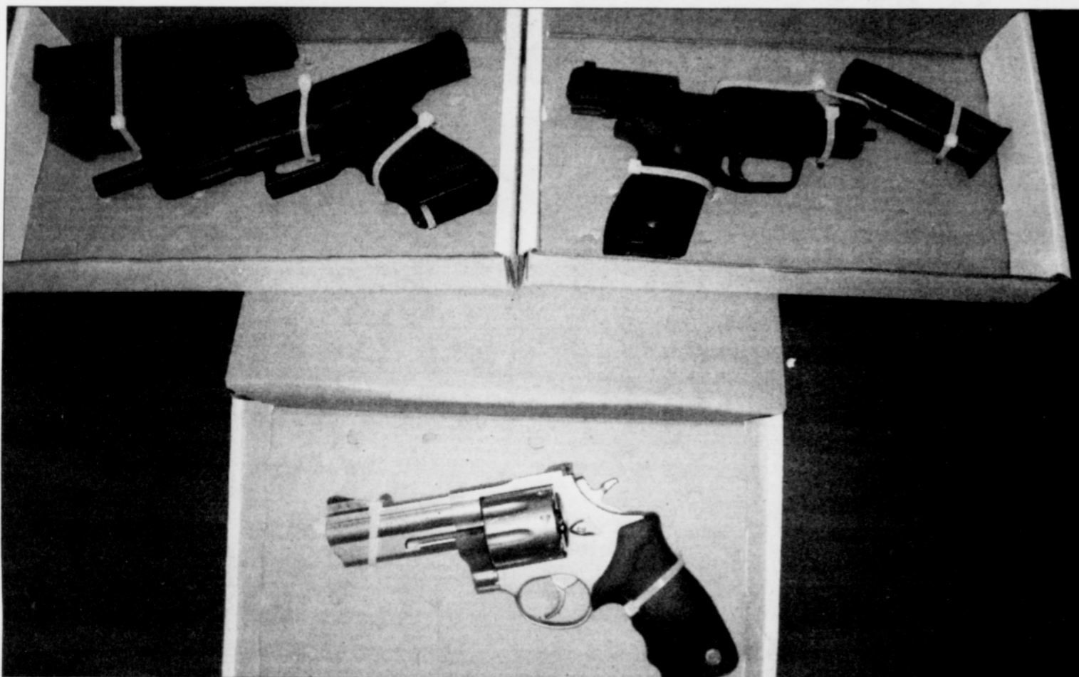
On July 16, members of the Portland Police Bureau Gun Task Force and Gang Enforcement Team recover three handguns from two apartments on Northeast 82nd Avenue. The guns had previously been reported stolen.

"Our goal is to make it harder to get a gun if a criminal or juvenile," he