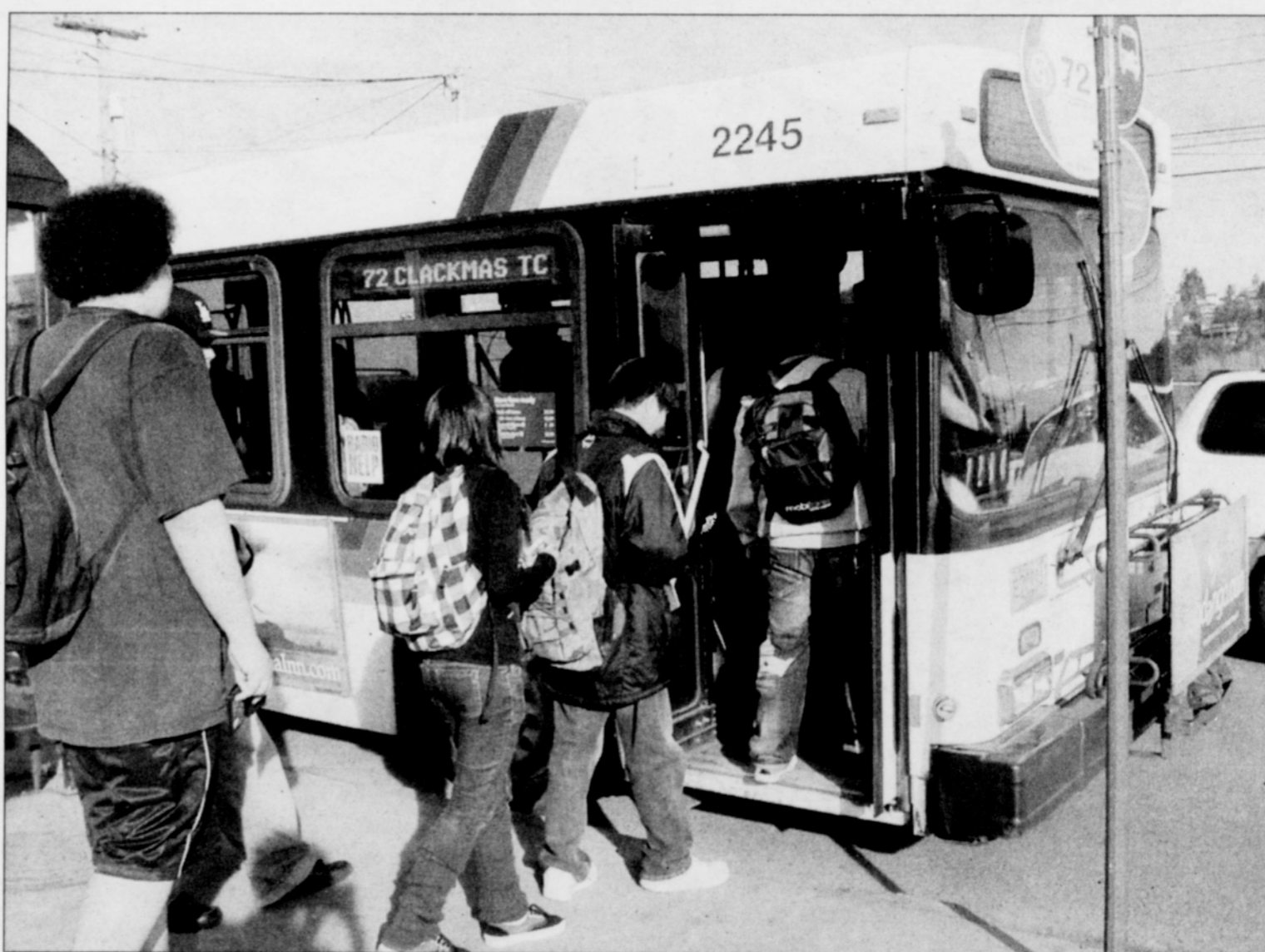
Free TriMet rides for students will continue thanks to a new funding agreement from the city, TriMet and Portland School District.