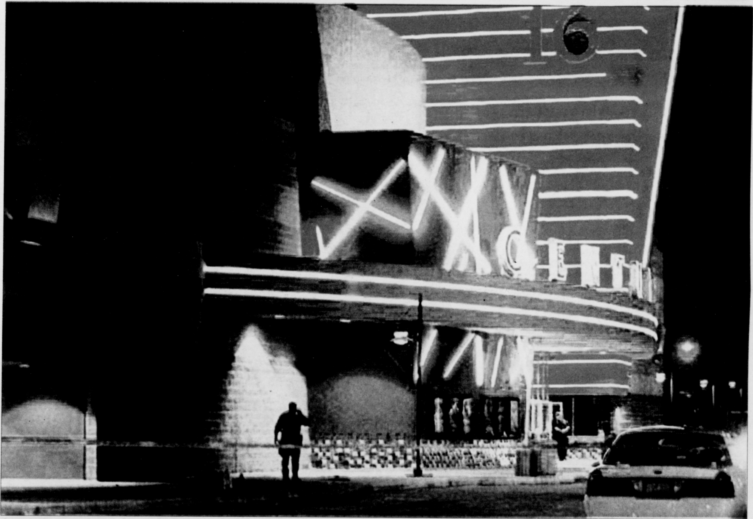
A movie theater in Aurora, Colo. is surrounded by police after a gunman terrified a packed audience at the premiere of the latest Batman movie by using tear gas, a semi-automatic rifle, shotgun, and pistol to kill 12 people and injure dozens more. Authorities said the weapons were easily purchased over the Internet.