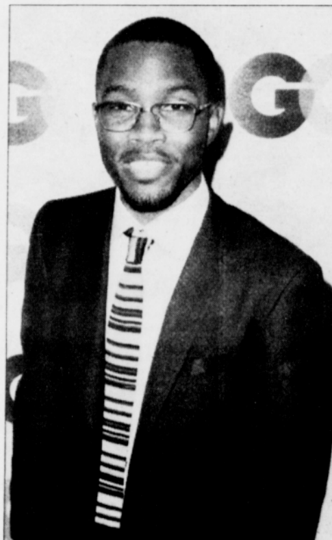
Frank Ocean arrives at the 16th annual GQ "Men of the Year" party in Los Angeles. The rising and highly acclaimed singer revealed last week on his website that his first love was a man.

A few days earlier, CNN's Anderson Cooper acknowledged that he was gay. But the admission from the 24-year-old Ocean—who is part of the hip-hop collective Odd Future and was prominently featured on Jay-Z and Kanye West's "Watch the Throne" album—is noteworthy because he inhabits the world of rap, where anti-gay sentiments have