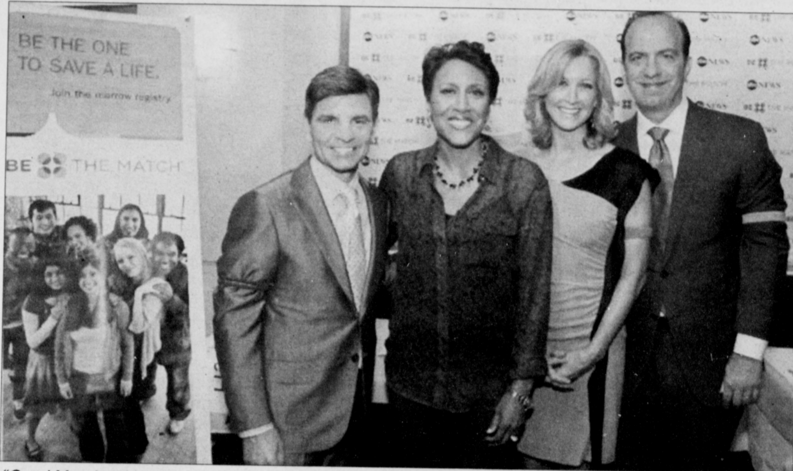
"Good Morning America" hosts, from left, George Stephanopoulos, Robin Roberts, Lara Spencer and ABC News President Ben Sherwood at a bone marrow registry drive last week at ABC News headquarters in New York.