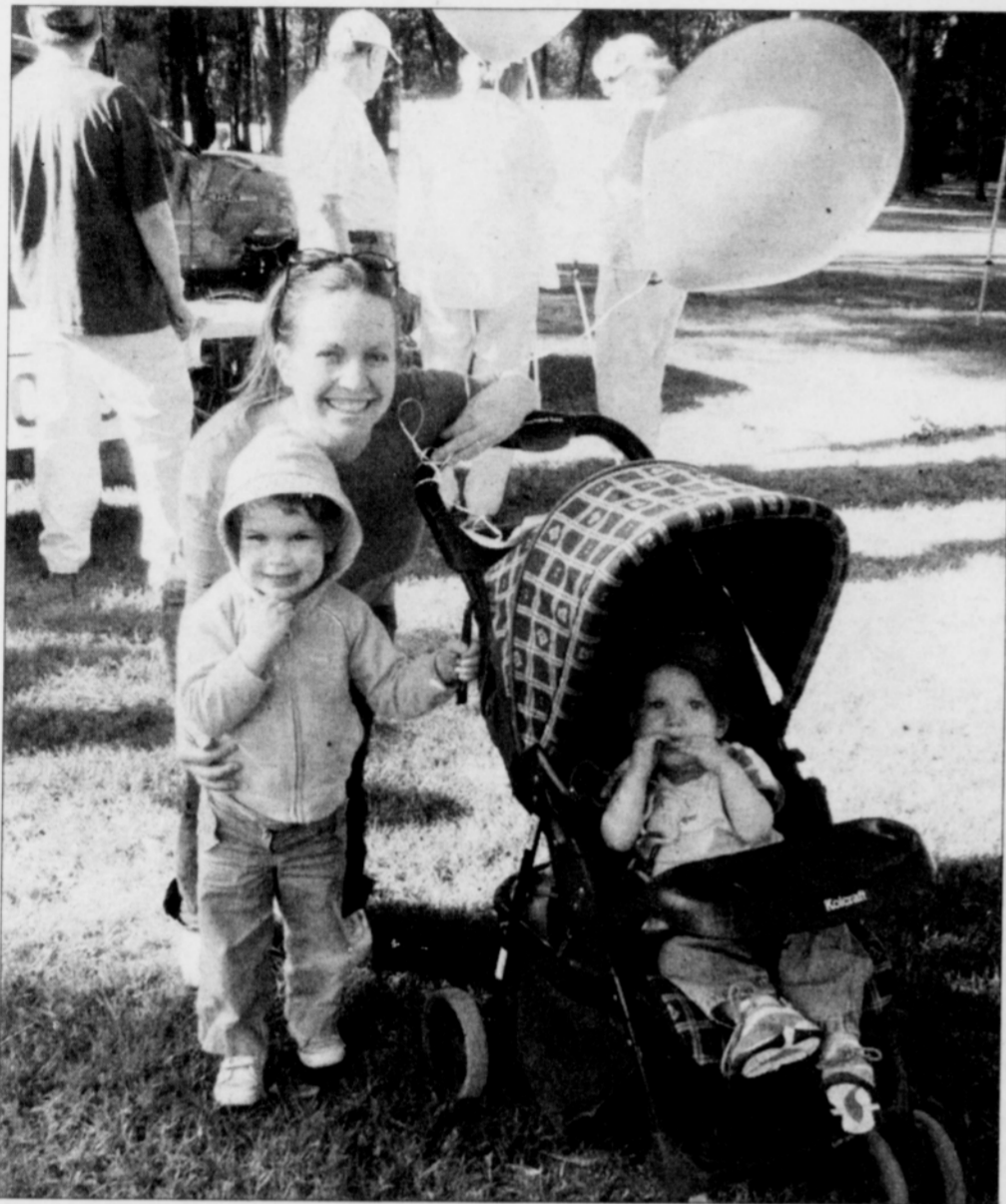
Family, friends and neighbors gathered at Camille Park for Beaverton's annual summer Picnic in the Park series on July 14, an event featuring free food, prizes and music provided by the Beaverton Community Band.