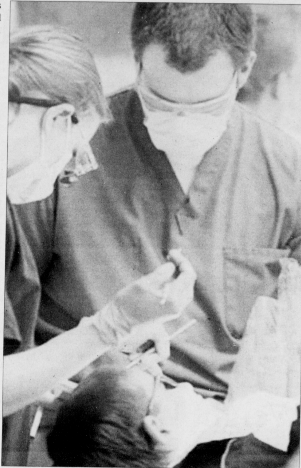
Dental professionals clean a youngster's teeth on Children's Dental Health Day at Clark College in Vancouver.

With the addition of paperless charting technology and an advanced radiology suite, students will be workforce ready upon graduation.