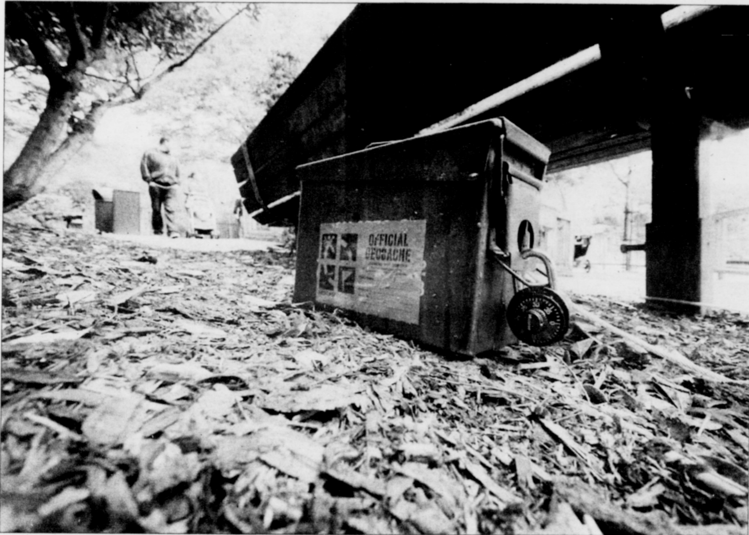
Oregon Zoo visitors can use GPS-enabled devices to locate four geocache containers hidden in public spaces around zoo grounds.