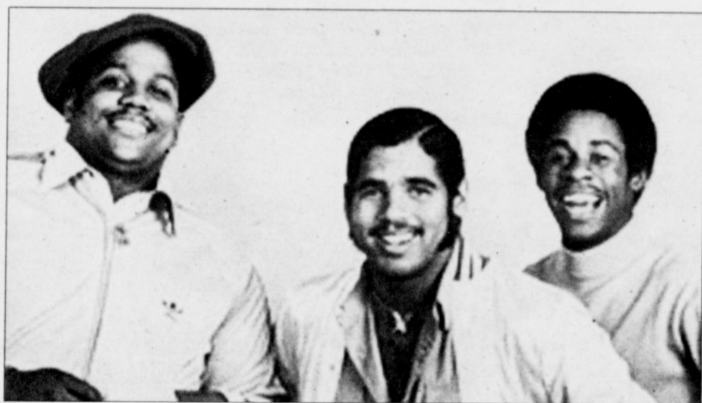
The Sugar Hill Gang's 1979 release 'Rapper's Delight,' was the first commercially available rap record. Recordings from the group have been inducted into the National Recording Registry.

Summer's 1977 hit "I Feel Love" is joining the Grateful Dead's famous 1977 Barton Hall concert as sounds