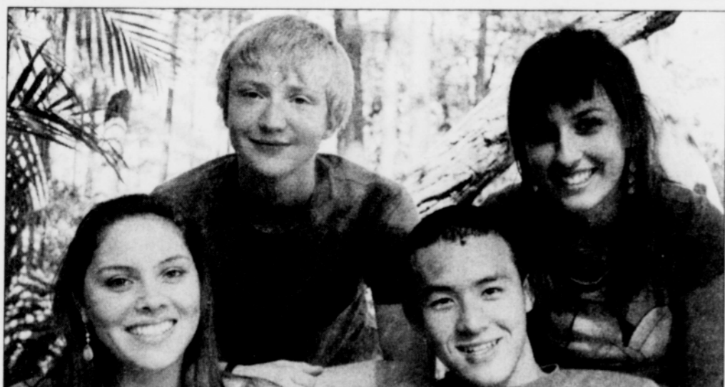
International students from more than 90 countries participate in the AFS Intercultural high school student exchange program.