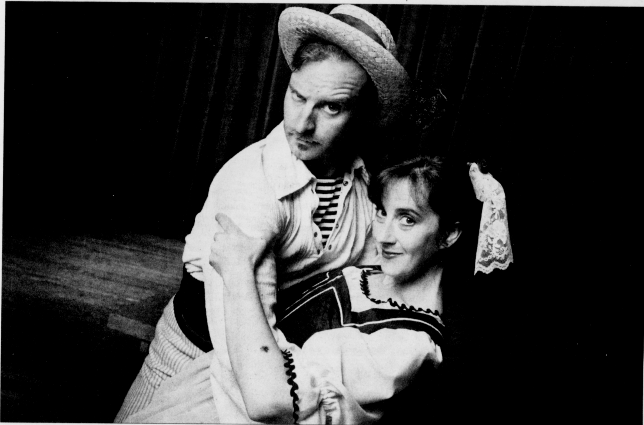
University of Portland hosts the Gilbert and Sullivan operetta The Gondoliers , opening Friday, June 1 and continuing with performances through June 24 in Mago Hunt Center Theater on the university's north Portland campus.