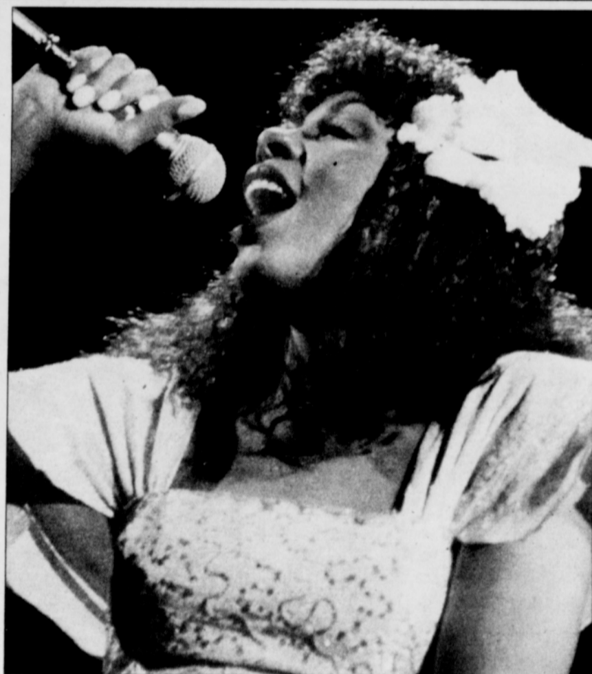
Donna Summer performs onstage in 1978. The singer won five Grammy Awards and six American Music Awards during her career.

It had been decades since that brief, flashy moment when Summer was every inch the Disco Queen.