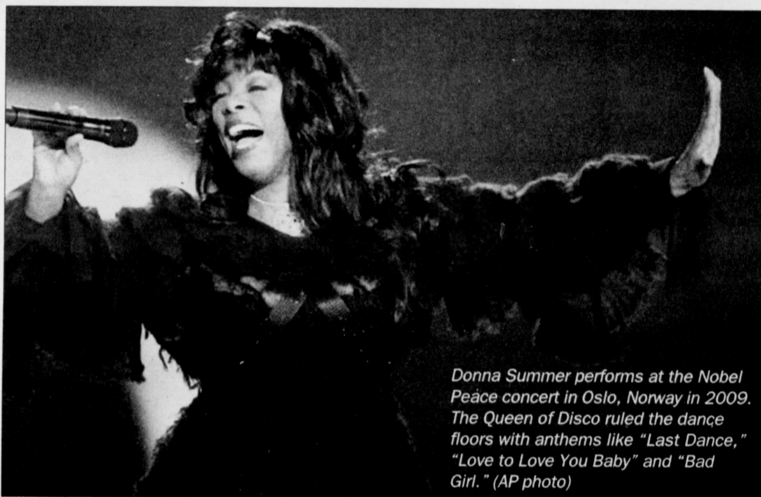
Donna Summer performs at the Nobel Peace concert in Oslo, Norway in 2009. The Queen of Disco ruled the dance floors with anthems like "Last Dance," "Love to Love You Baby" and "Bad Girl."

Luminaries from Aretha Franklin to Dolly Parton and Barbra Streisand mourned the loss, as did President Barack Obama, who said he and Michelle were saddened to hear of the passing of the five-time Grammy winner. "Her voice was unforgettable, and the music industry has lost a legend far too soon," he said. "Our thoughts and prayers go out to Donna's family and her dedicated fans."