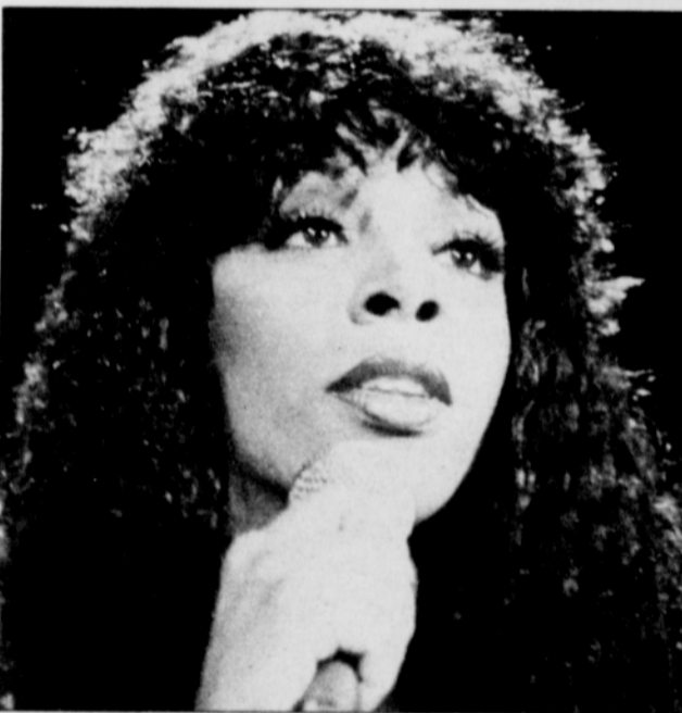
Donna Summer in 1979.