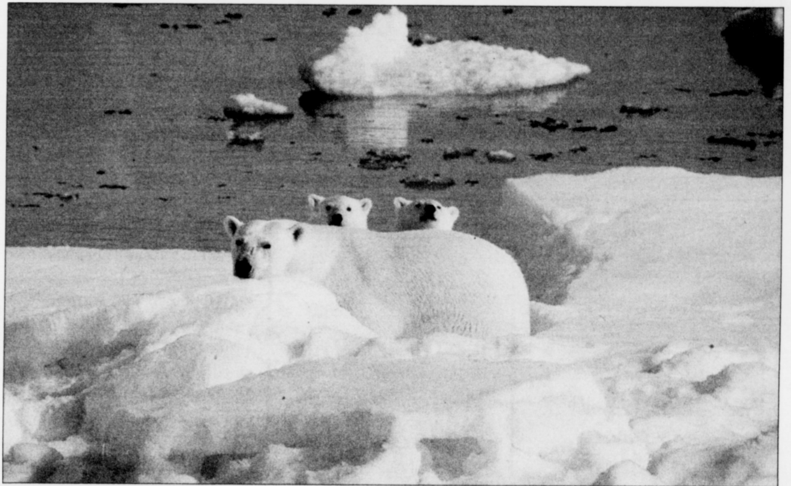
A polar bear mother protects her two cubs in the new IMAX film 'To the Arctic,' now playing at the Oregon Museum of Science and Industry.

The stunning beauty of the Arctic is palpable in this giant-screen film that aims to cultivate a sense of our connectedness, relevance, and impact on this spe-