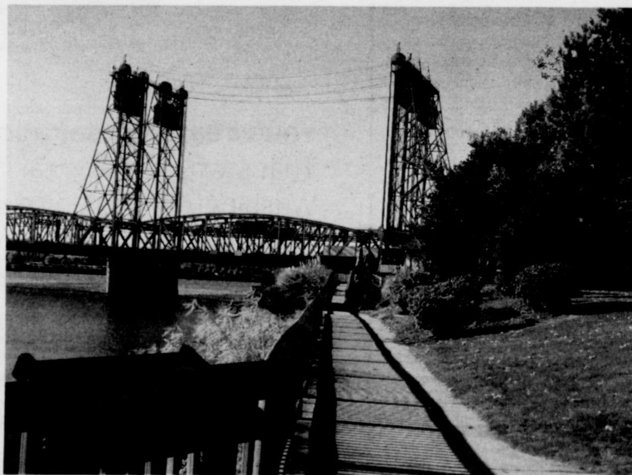
Vancouver Waterfront Trail near the I-5 Bridge will grow with the redevelopment of Vancouver's Waterfront Park next to the historic downtown.

For more information, visit cityofvancouver.us/waterfront .