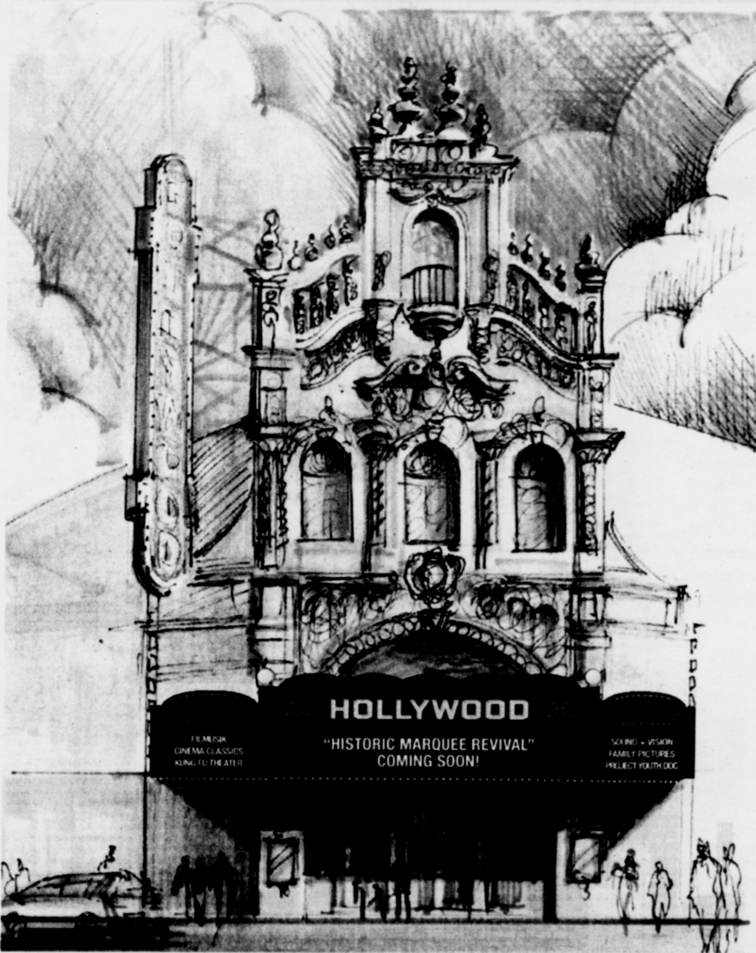
An artist's rendering shows what a classic marquee would look like positioned above the sidewalk and at the entrance of the historic Hollywood Theatre in northeast Portland.