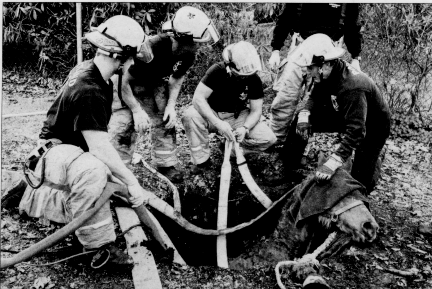
Portland firefighters rescue a horse Monday which fell into an old septic tank in a northeast Portland backyard.

night in a gated community in Stanford, Fla., on Feb. 26. The man who shot him, 28-year-old George continued ▼ on page 7