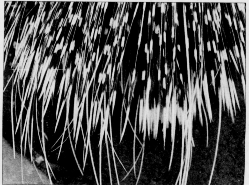
African crested porcupines, the largest porcupine species in the world, ward off enemies with spiny quills up to a foot long.

To learn more about buying your first home through Proud Ground visit proudground.org or call 503-493-0293, extension 11.