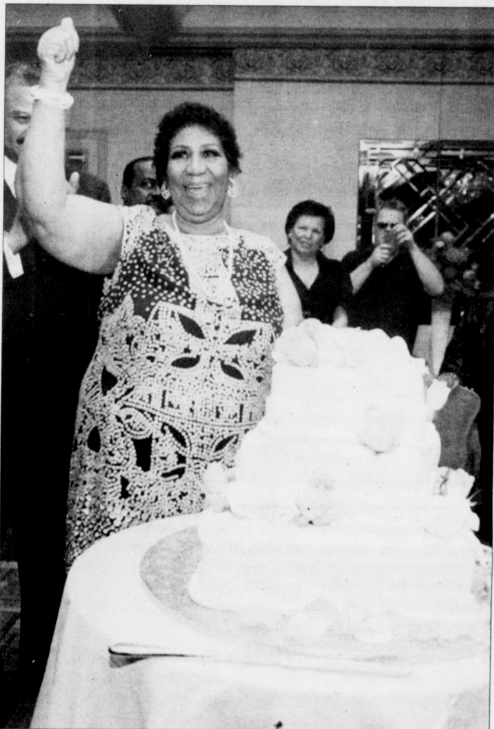
Aretha Franklin attends her 70th birthday party in New York, Saturday.

When asked whether marriage might once again be in her future, the Queen of Soul simply said: "We'll see what happens."