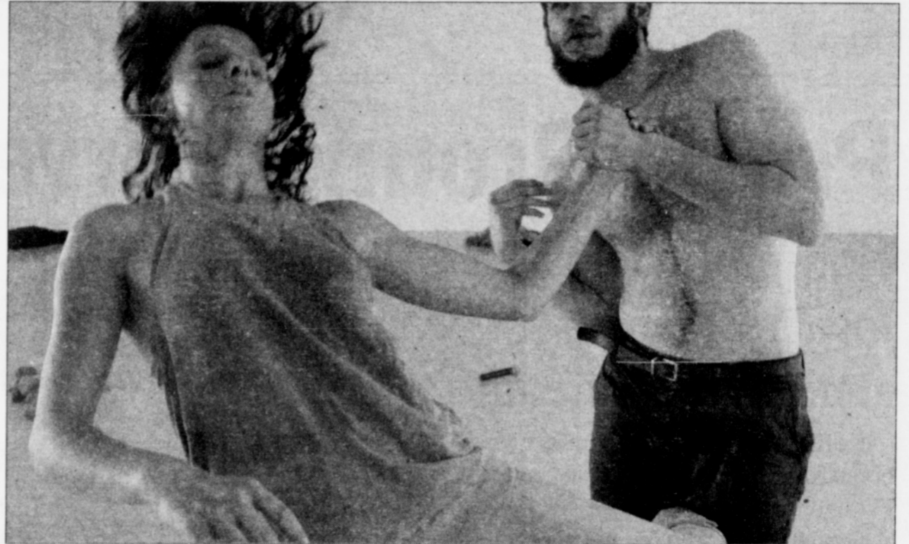
White Bird Uncaged presents Israeli choreographer Yasmeen Godder's bold Love Fire, a twist on stereotypes of male and female identity.