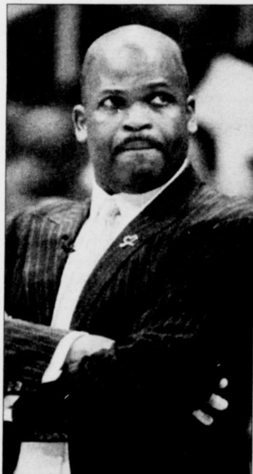
Former Blazers Coach Nate McMillan came to Portland in 2005.